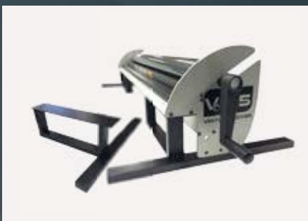
TABLE STAND VR15

Media Roller kit for easy mounting on the back of your Vinyl Remover. Suitable for larger jobs from rolls from your plotter or printer.